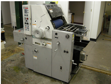
Hamada VS34LS II