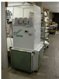
Air Duster 3000