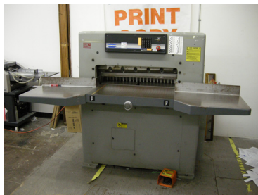
Challenge 305 MPC